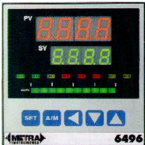
96 x 96